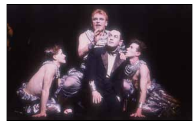
Tough boy fairies, 1987