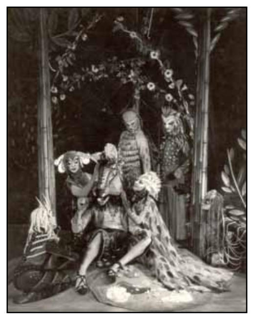
Bird masked fairies, 1954