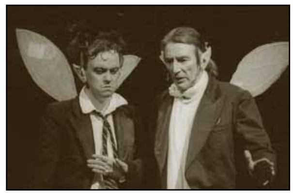
Puck and Oberon, 1989