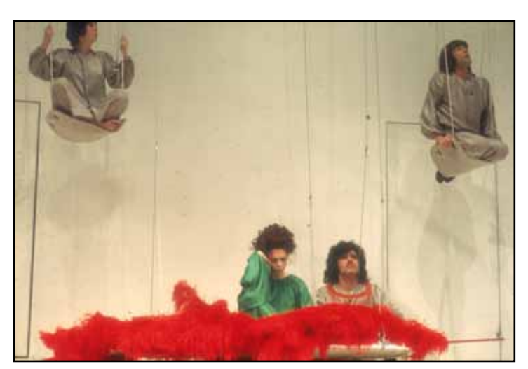
Fairies on Trapezes, 1970