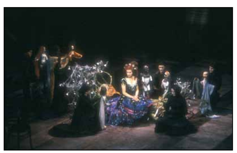
Puppet Fairies, 1981