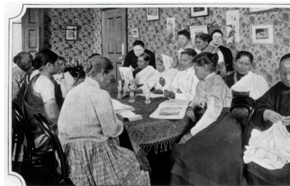
IN THE AYAHS' HOME (HACKNEY).

'You have a roof over your head, a decent bed with a soft mattress and coverlets...And most importantly – clean wash-rooms'.