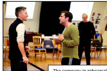
The company in rehearsal